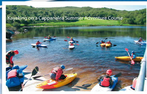
Kayaking on a Cappanalea Summer Adventure Course

All of the Summer Non-Residential Adventure Courses 2020 at Cappanalea NCOET give young people (non-residential ages between 7 and 15 years of age), from all over Ireland an opportunity to participate in an active, healthy, safe and varied outdoor adventure programme. The activities are tailored to suit the different age categories. We endeavour to keep age groups together for the activities. The courses include some of the following activities: